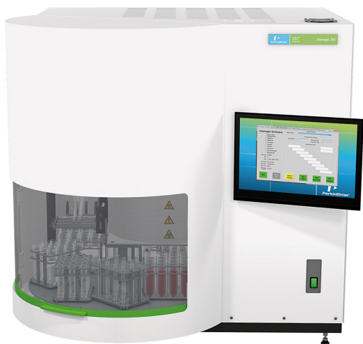
chemagic™ 360 instrument

Experience the revolutionary compact benchtop design of our new developed chemagic 360 instrument. Based on the well established chemagen Technology, the system offers a reliable nucleic acid isolation solution for your high throughput sample processing needs. Equipped with the intuitive chemagic QA Software and the chemagic Dispenser 360 unit the systems allows LIMS-compatible bar code reading/sample tracking and automated buffer filling for all volume applications. Due to its modular set up, the chemagic 360 instrument can be integrated with standard liquid handling units.