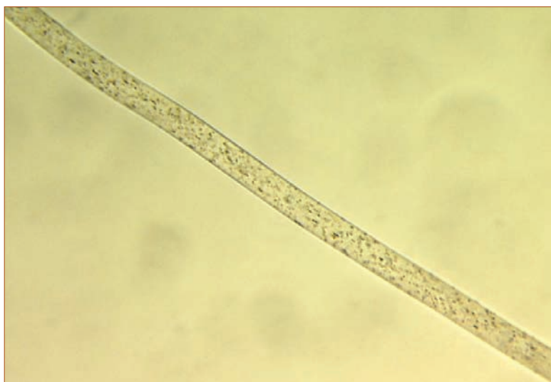
Figure 1. Fiber under microscope.